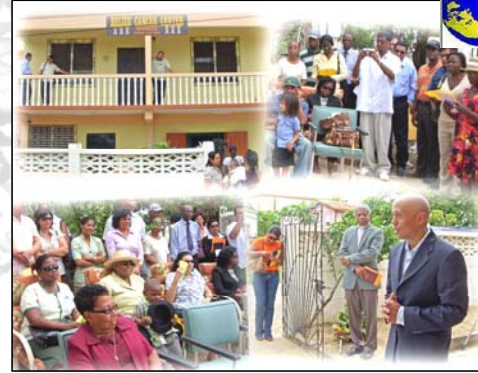
Opening ceremony on October 1, 2008.

Please cut along dotted line before mailing