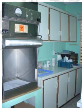
Laminar Flow Hood for mixing chemo.